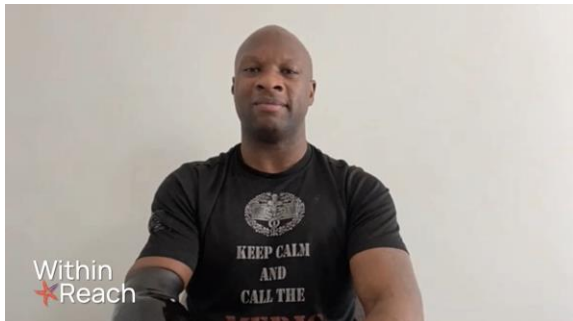
Mr. White, with unilateral, below-elbow limb loss, is pursuing hand/arm transplantation.

Within Reach is interactive and contains 188 videos, 29 photos, and 7 graphics.